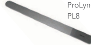
ProLyne nail file & foot dresser (20cm)